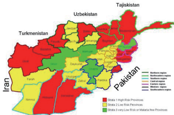
Figure 1 Provincial malaria risk strata.

Presently, around 60% of the population in Afghanistan is at risk of malaria infection (Asha, May 2003). It is estimated that the highest incidence (23%) is in the Northeast region of Takhar province, followed by Kunduz province (13%). Current malaria strata for all 31 provinces in Afghanistan are shown in Figure 1 (Safi et al., 2009).