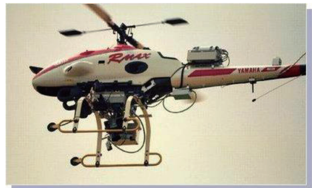
Figure 1. Radio control (RC) helicopter made by YAMAHA Motor Co., Ltd.

The purpose of this study is to develop a methodology for the