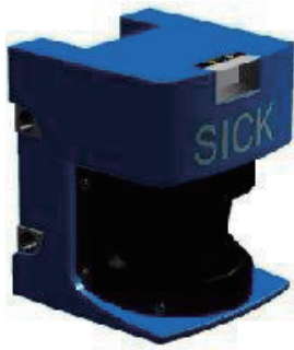
Figure 2. The SICK Laser Measurement Sensor (LMS) 200