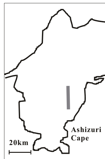
Figure 1. Map of the transect in the western part of Shikoku Island.

forest of Sugi ( Cryptomeria japonica ) and Hinoki cypress ( Chamaecyparis obtusa , n = 24). The plot was 15-m wide and 15-40-m long, depending on tree density. We measured stem diameter at breast height (DBH) and tree height in the plots. Two points on the plots were surveyed using differential GPS Trimble Pathfinder Pro (Trimble Inc. USA) for more than 10 min.